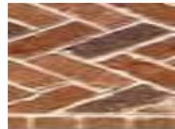
masonry or brick